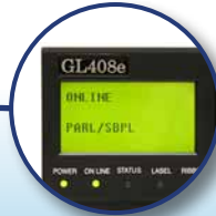
Large LCD Display Panel